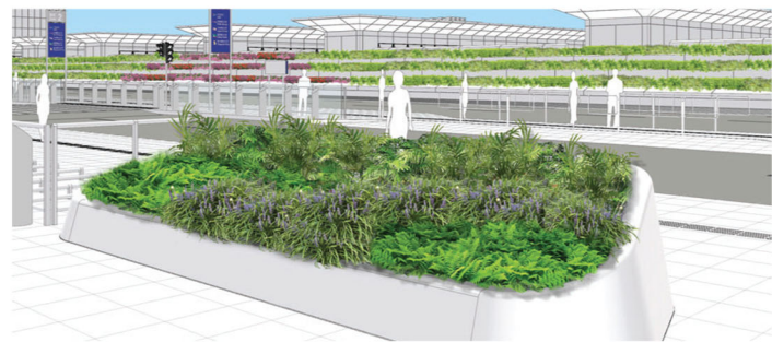
Planter design for soft landscape