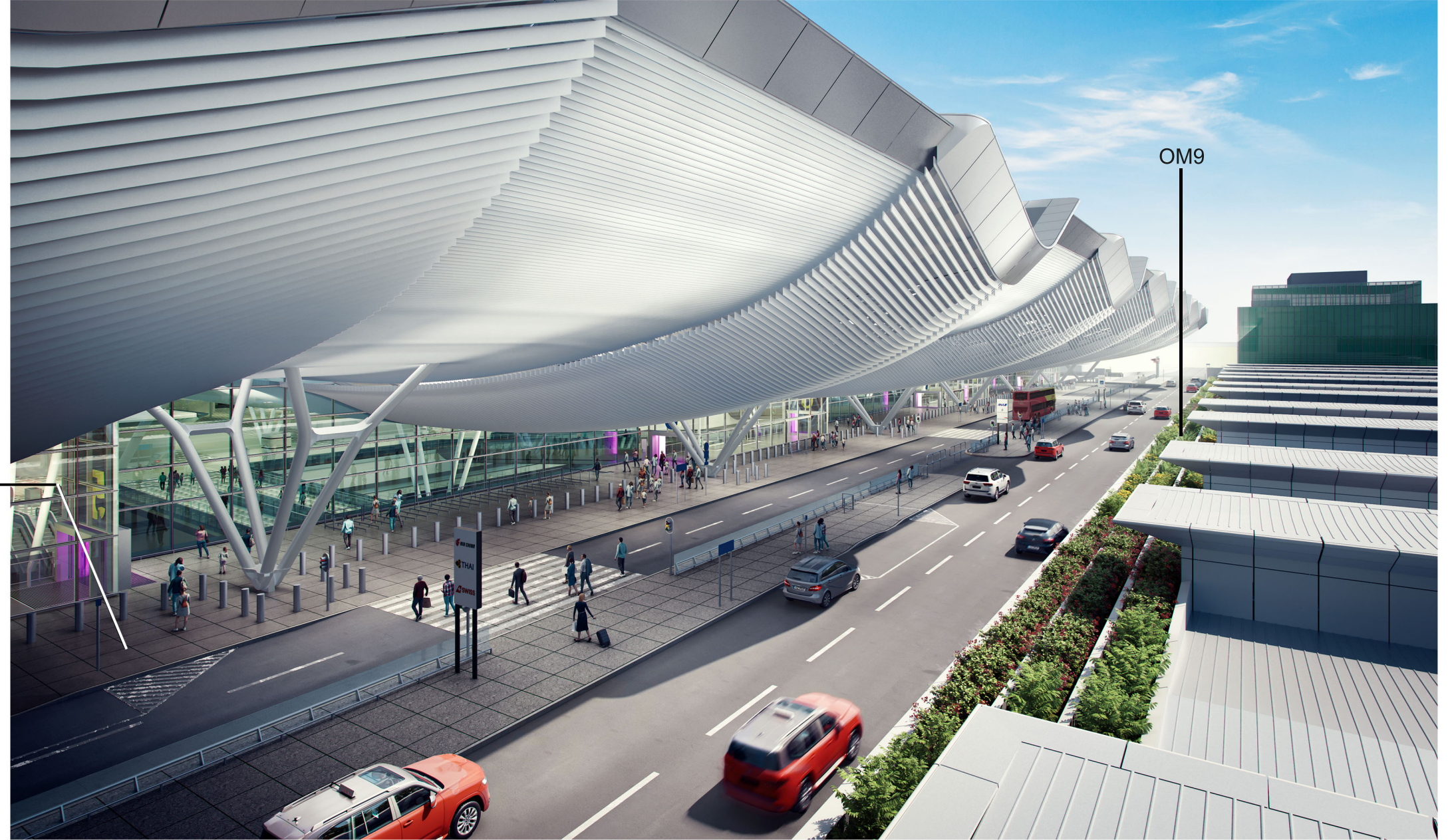
Artist's Impression of Departure Road for T2 Building (OM8 & OM9)